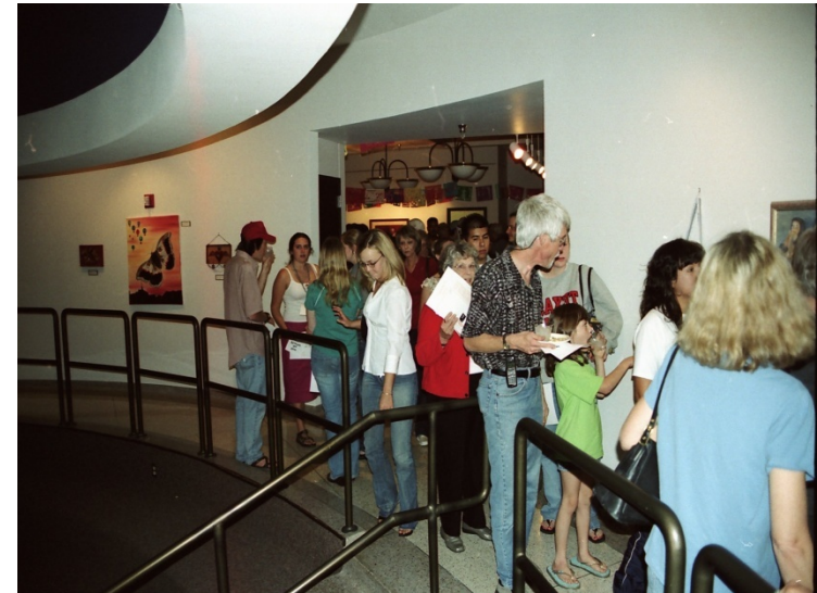
A large crowd attends our annual Dia de los Muertos opening.

In 2009, over 400 events were held at the International Cultural Center.