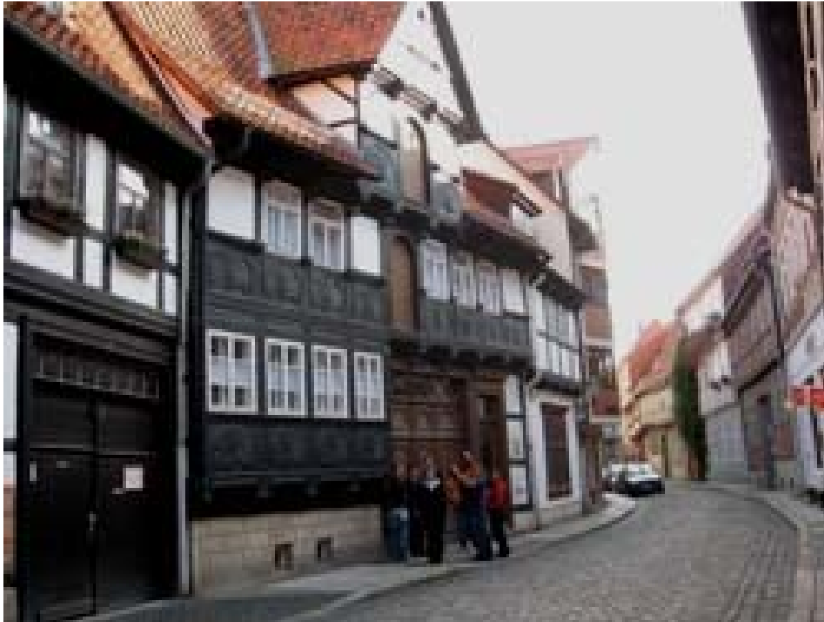
TTU Students at the Center