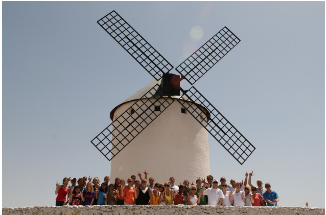
Seville Summer Students, Guns Up!