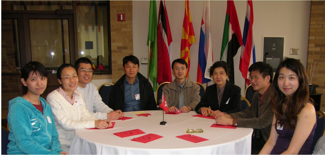
International Student Graduation