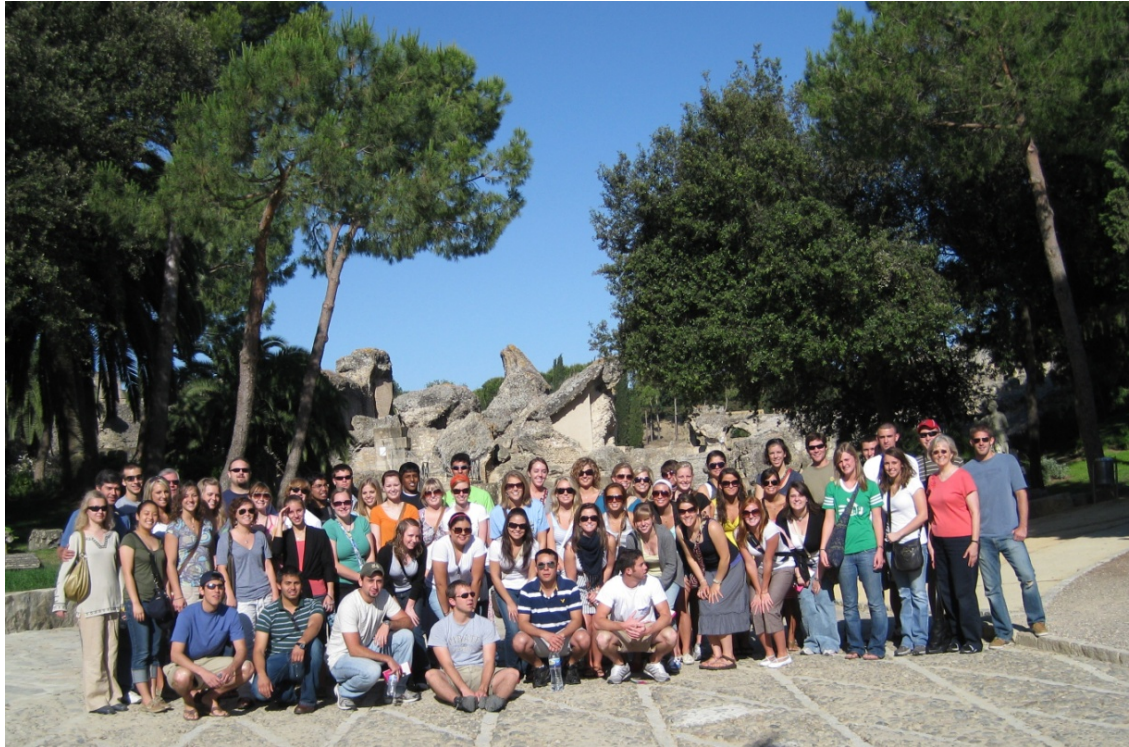
Plaza de Espana

Summer group at Roman ruins of Italica located just outside the Seville city limits.