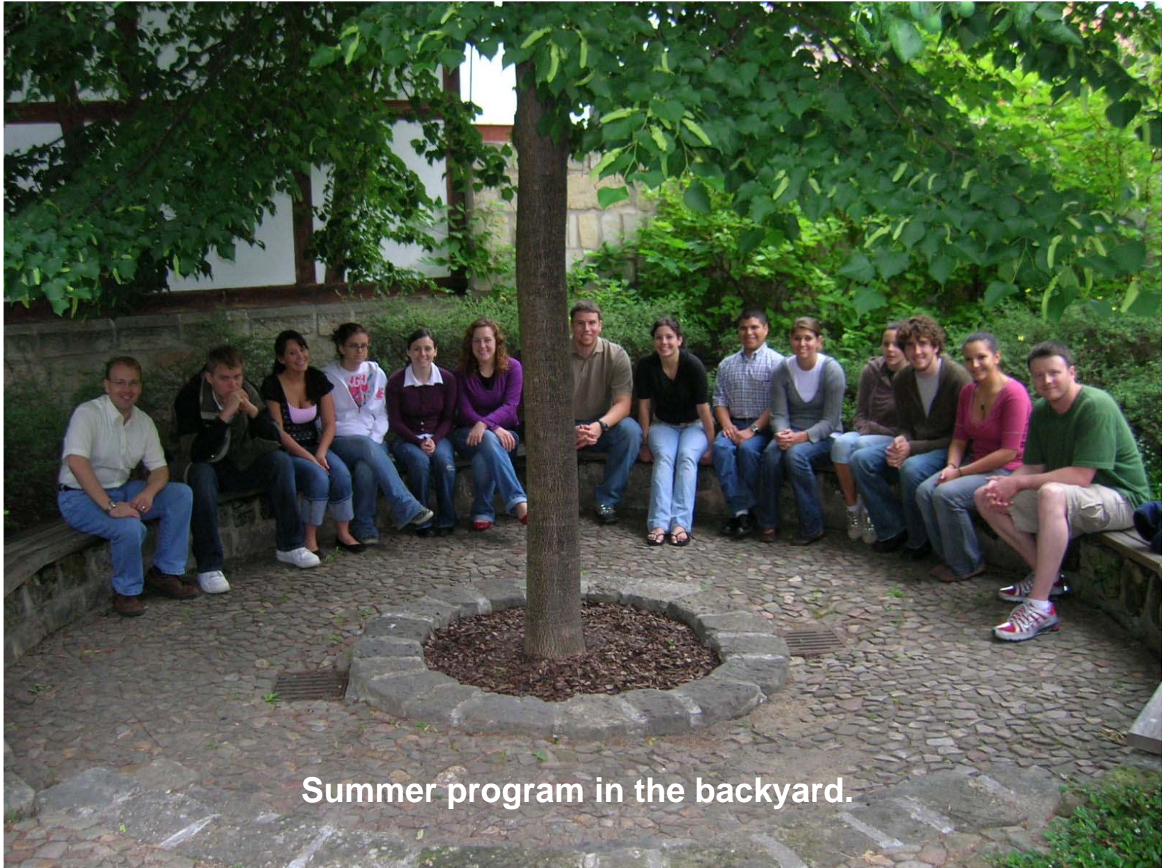
Summer program in the backyard.