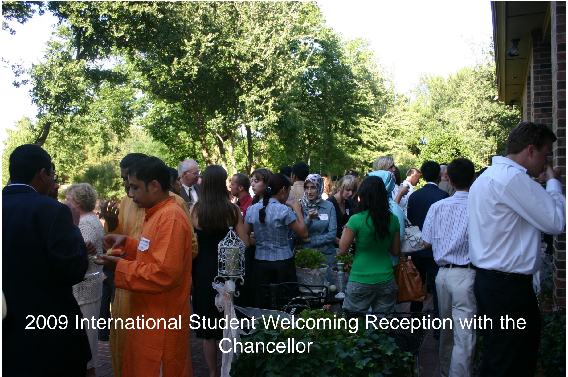
2009 International Student Welcoming Reception with the Chancellor